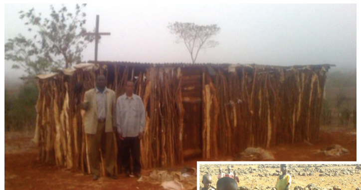
A new Rendille church

Commander Kawe was especially moved by what he saw and experienced among the Pokot people. Many of the churches were constructed out of sticks, and some had no walls—only a roof supported by poles. One church had no building—it consisted of only a few makeshift benches under a tree. Some of the villages could only be found or reached with the assistance of a guide. In some cases, someone had gone ahead the day before to slash the brush so we had a trail to follow. Commander Kawe also learned that many of the Pokot pastors had